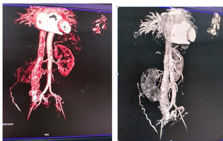
Figure 4: 3D reconstruction of abdominopelvic MRI showing an extensive intravascular leiomyomatosis extending up to the right atrium.

We completed with an abdominal-pelvic MRI which demonstrated the presence of a hypervascular lesion in the right ovarian vein that extended from a 5 cm lesion in the right lateral uterine wall, enhancing with gadolinium in a manner identical to the myometrium and extending to the inferior vena cava with significant cardiac extension, suggestive of intravenous leiomyomatosis (Figure 4).