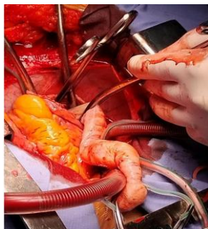
Figure 5: Extraction of the tumor mass under extracorporeal circulation.

The therapeutic management was discussed by a multidisciplinary team including cardiologists, cardiovascular surgeons, and gynecologists and we decided to perform a total hysterectomy with bilateral adnexectomy associated with a delivery of the tumor through the inferior vena cava under extracorporeal circulation. Our patient underwent surgery on 31/03/2023 ( Figure 5, 6 ).