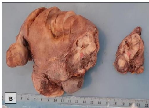
Figure 7 (B): On the cut surface, multiple fasciculate and grey-whitish nodules involving the right uterine wall.

Microscopically, the tumors consisted of intravascular nodules of intersecting fascicles of spindle-shaped cells originating from venous walls. The neoplastic cells have indistinct borders, eosinophilic cytoplasm, and centrally located and blunt-ended cigar-shaped nuclei without atypia. Few mitotic figures were seen. The mitotic count was 1 per 10 high-power fields. The tumor showed an increased vasculature and foci of hyalinization and hemorrhage. In an immunohistochemical study, the neoplastic cells were diffusely positive for desmin, smooth muscle antigen (SMA), estrogen, and progesterone receptors (Figure 8). Therefore, the diagnosis of uterine intravascular leiomyomatosis (UIVL) was made.