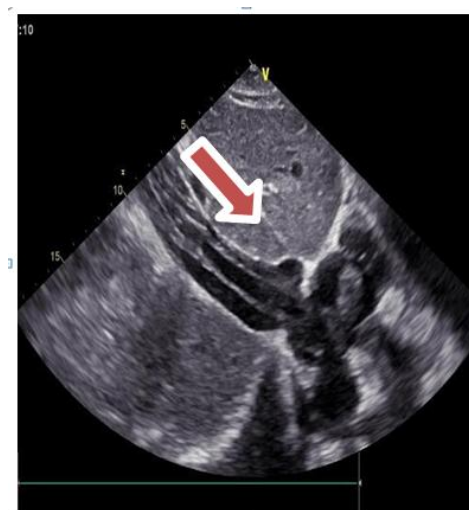
Figure 1: Subcostal echocardiographic section showing a hyperechoic mass in the inferior vena cava extending to the right atrium.

A trans-thoracic and trans-esophageal echocardiogram was performed and revealed the presence of a mobile echogenic mass, with a serpentine appearance in the inferior vena cava and the right atrium measuring 70 * 24 mm. The mass was not adherent to the wall of the right atrium and passed on either side of the tricuspid valve without causing obstruction or functional impairment of the right cavity. (Figure 1; Figure 2). We discussed the differential diagnoses for cardiac mass that include a myxoma which presents the most frequent type of benign cardiac tumor. We excluded this diagnosis because of the echocardiography characteristics and the origin of the tumor. A thrombus, metastatic cancer but we hadn't favorable context, and lipoma were also considered.