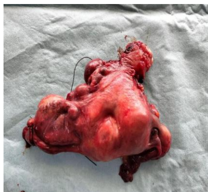
Figure 6: Operative specimen of total hysterectomy and bilateral annexectomy.

The gross examination of the surgical specimen showed multiple grey-whitish firm fibroids including the right lateral uterine wall and the right broad ligament. These tumors ranged in size from 5 mm to 5 cm with a fasciculate aspect on the cut surface. These tumors spread into fallopian tube vessels and utero-ovarian veins forming an oblong mass of 26 cm in length into the vena cava ( Figure 7 ).