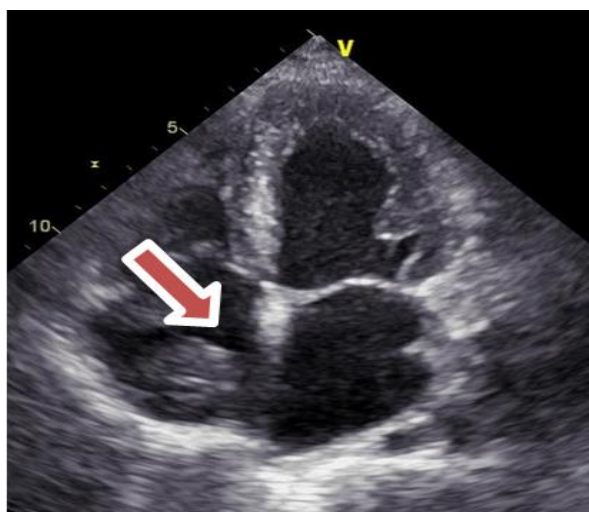
Figure 2: Four-chamber echocardiographic section showing the presence of a well-defined hyperechoic mass in the right atrium.

Further investigation was initiated including tumor marker testing (ACE, CA 19-9, CA 125) which came back negative; immunological screening (anti-nuclear antibodies, anti-SSA, anti-SSB, anti-cardiolipin