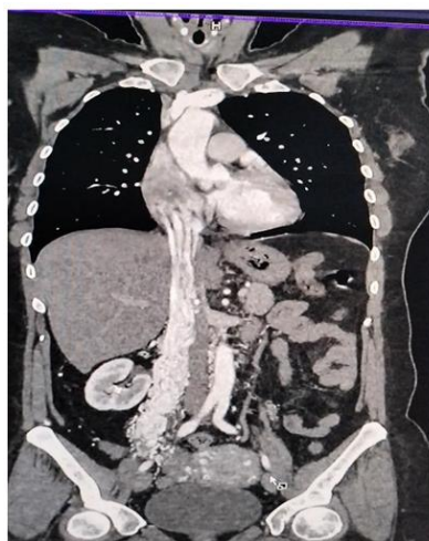
Figure 3: Longitudinal section of thoracic-abdominal-pelvic CT scan showing the tumor mass extending from the right utero-ovarian vein to the right atrium.

The patient underwent a thoracic-abdominal-pelvic computed tomography angiography that showed a hypervascular tumor originating from the pelvic region from the right ovarian vein extending to the inferior vena cava and the right atrium. The diagnosis of intravenous leiomyomatosis extending from the ovarian vein to the inferior vena cava and the right atrium was suspected (Figure 3).