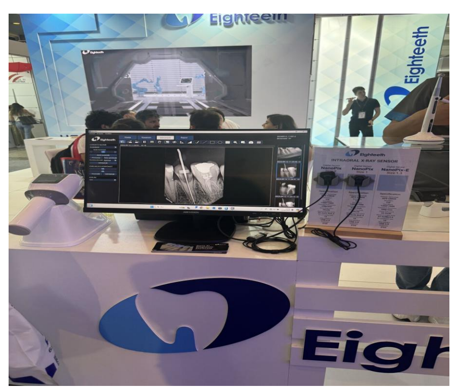
Figure 5: Eighteeth brand x-ray.